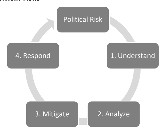
Figure 2. Four-part framework managing political risks